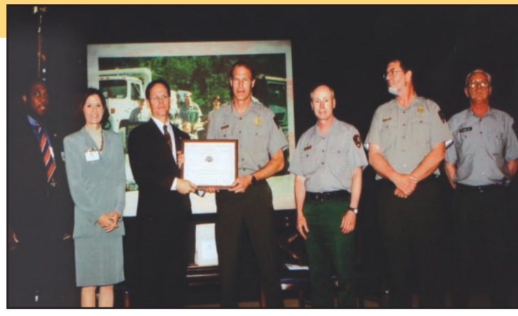
Pictured Rocks National Lakeshore staff received the prestigious White House Closing Circle award in 2002 for their many environmental efforts, including use of biobased products.

"We loaned him a gallon of parts cleaner, and later he reported it worked wonderfully. The locks could be cleaned with inmates in the cells without any adverse affect on them or the people doing the cleaning. They tell me: